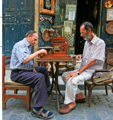
↙ Clockwise from far left: Baskets with spices at east bazaar in Cairo; two men playing backgammon at Souk Khan el-Khalili; buying souvenirs at Sharm el Sheikh; bread seller in Hurghada; keep hydrated with bottled water