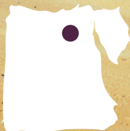
↙ The Pyramids of Giza

THE PYRAMIDS OF GIZA are undoubtedly the most iconic symbols of Egypt and indeed the ancient world. Situated near the sprawling capital city of Cairo, the pyramids are thought to have been constructed between 2550-2490 BC during the reign of three different pharaohs. In ancient Egypt, death was not feared. In the case of kings, it was widely believed that death was simply the next step toward eternal life and that this transition would see them become gods themselves. In order to prepare for this journey, the rulers of ancient Egypt built pyramids as tombs and filled them with things they would need in the afterlife. Antiquities thought to have been left in the tombs were items such as canopic jars, amulets, chalices and statues of various gods. ►